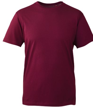
BURGUNDY PAN 7644C