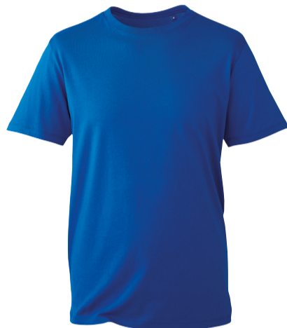
ROYAL PAN 4153C