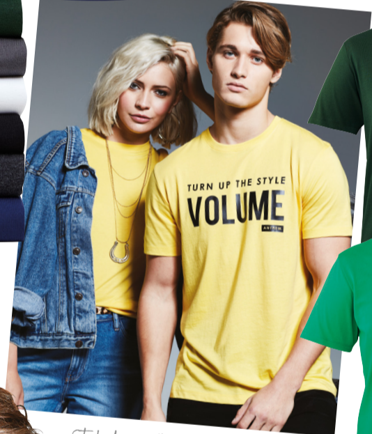
Styled up with Denim on Denim!