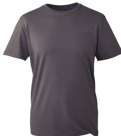
CHARCOAL PAN 425C