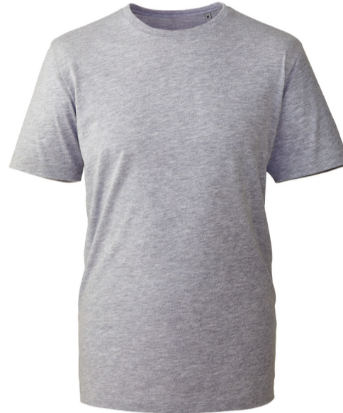
GREY MARL COOL GREY 7C