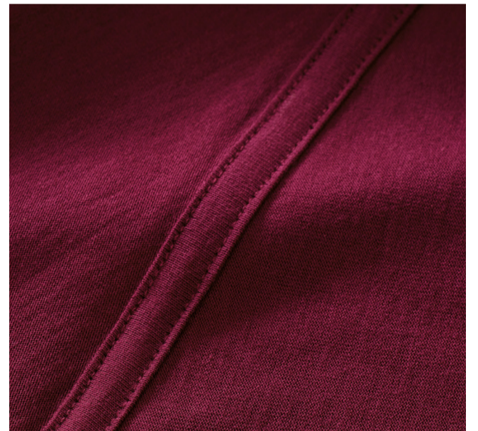
Soft self-fabric tape for neck and shoulder