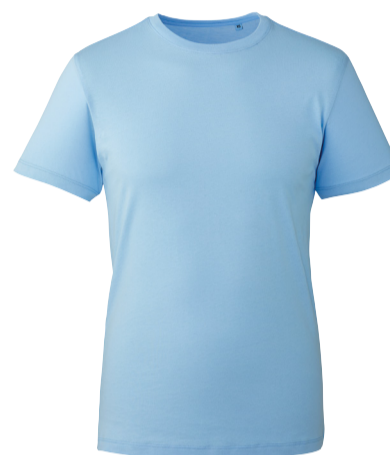
LIGHT BLUE PAN 644C