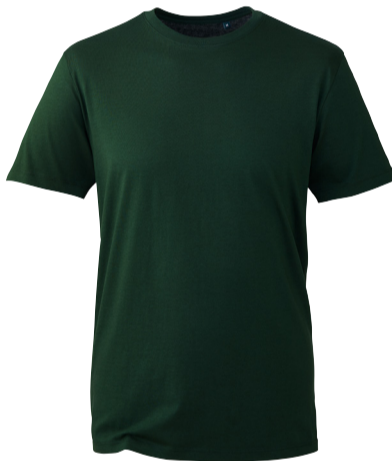
FOREST GREEN PAN 5605C