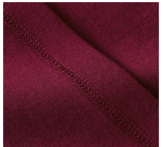
Twin-needle chain stitch on hem and sleeve