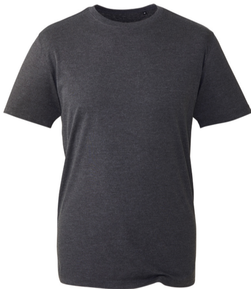
DARK GREY MARL PAN 425C