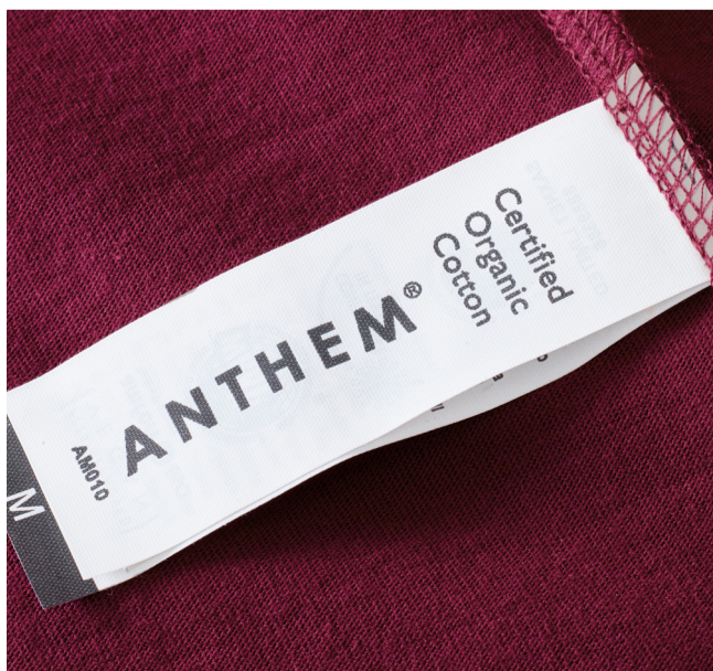
Side seam label