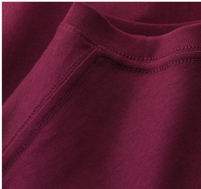
Chain stitch detailing on the shoulders and nape of the neck

We have spent years perfecting the AM010 Anthem tee, consciously made and created with an incredibly soft-feel and a super-drape finish for the imprint market, delivering this legendary base for decoration.