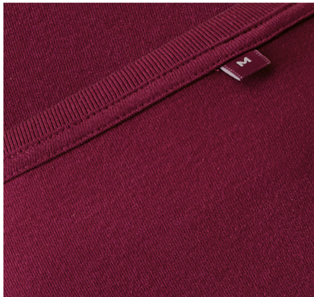
Fine rib neck band and a self-coloured size label