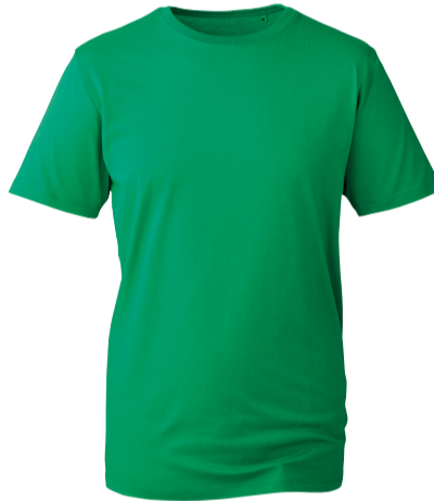
KELLY PAN 7724C