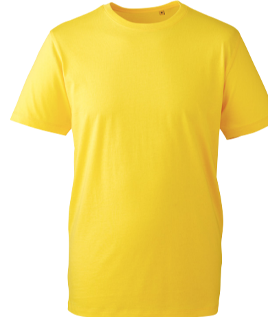
YELLOW PAN 109C