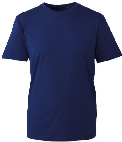
NAVY PAN 533C