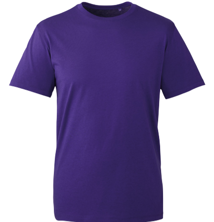
PURPLE PAN 2695C