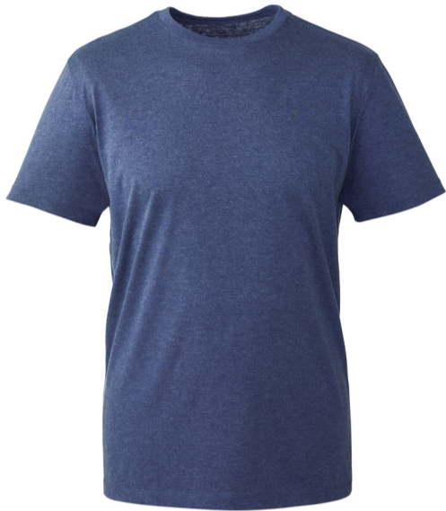
NAVY MARL PAN 4139C