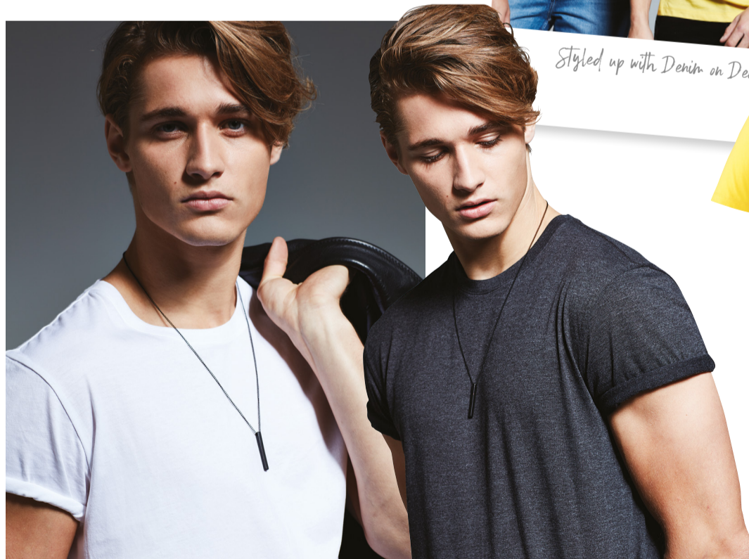
Classic Vintage style with Black & White