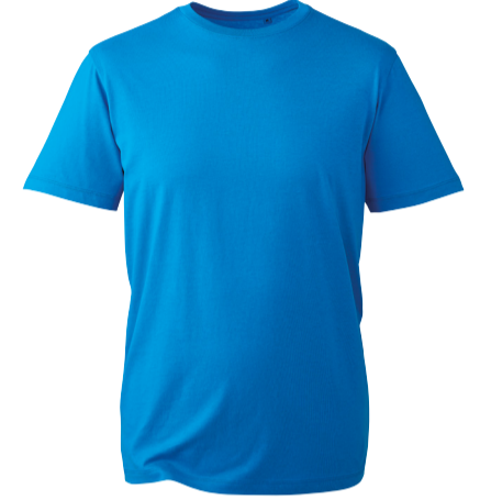
SAPPHIRE PAN 2185C