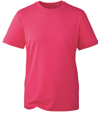
HOT PINK RUBINE RED C