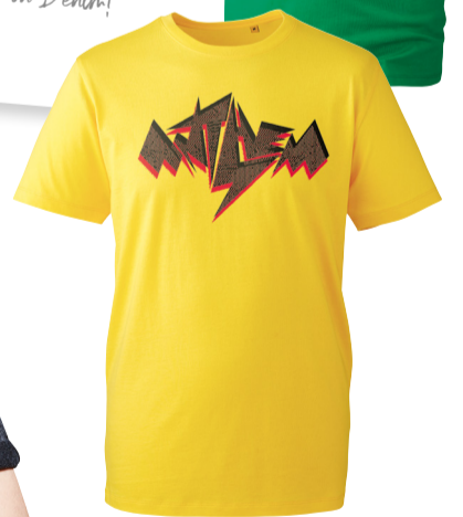
Worn to perfection