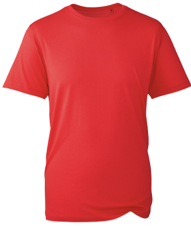
RED PAN 186C